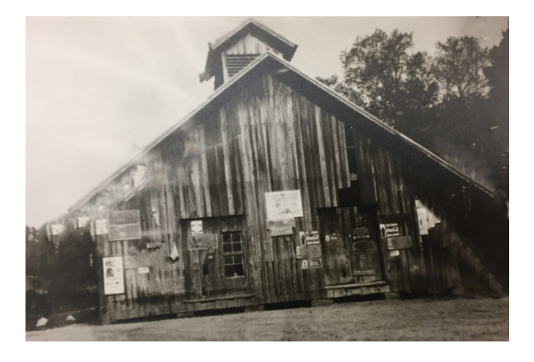
Moore's Mill

The Little River Dam in Zebulon which controlled water near the bridge over Route 97, was damaged from the rush of water created by Hurricane Matthew in October 2016. The dam is at the site of Moore's Mill, which is long gone except for its foundation stones near the dam site. But the mill had been active since at least 1868, and was a thriving center for the communities of Wakefield, Zebulon and Lizard Lick for generations.