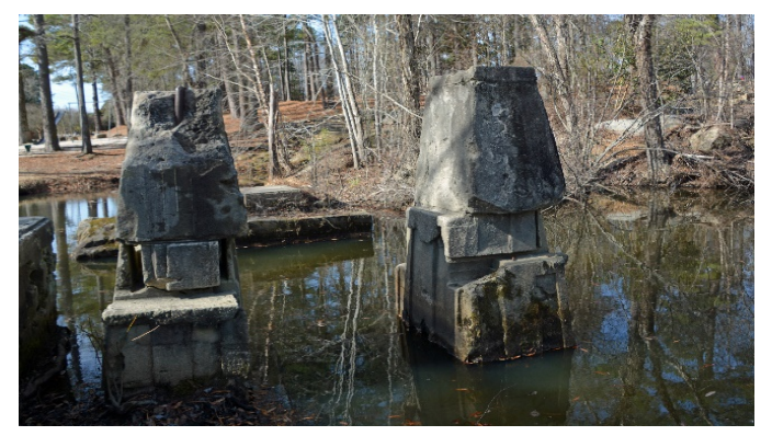
Moore's Mill in January 2018

been confirmed. The foundation stones for the mill are still there, but the millhouse is gone. The large millstones remained at the site for years. Charles Wood recalls finding the large millstone used as a firepit by a visitor recreating on the river banks.