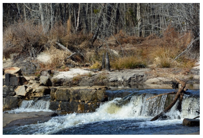
Moore's Mill in January 2018

In early 1915-1920s, the mill had a generator powered by a 12 cylinder Cadillac engine, and electricity was provided two days a week, on Fridays and Saturdays, for local people. Eventually 36 street lights in Zebulon were illuminated from the energy powered by the mill and an adjacent electric plant on the river.