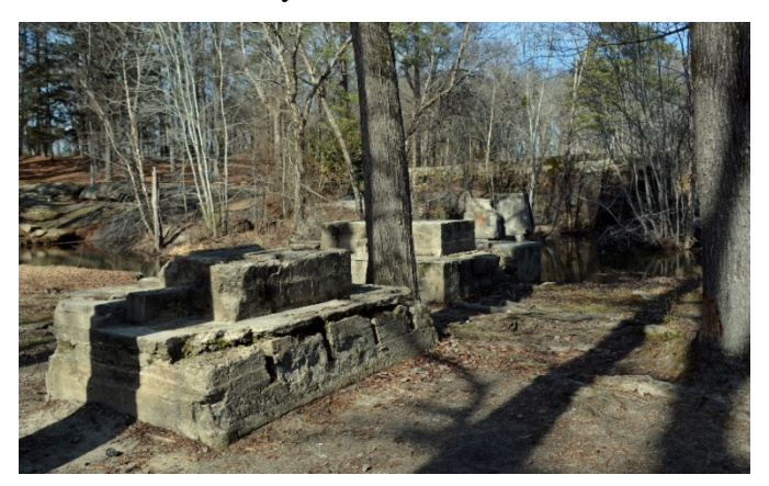
Moore's Mill in January 2018