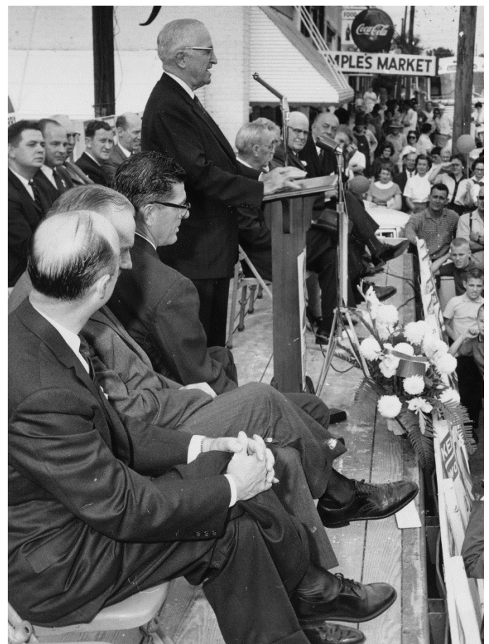
Harry Truman visited his daughter and son in law in Zebulon and slept at the house twice, in 1958 and 1960.

They were diplomats who lived in Saudi Arabia and Japan and their furniture, collected from their travels, mixed with the traditional American furniture of the Daniels. A back porch was enclosed as a sunroom in 1971, to add room to the house, and the kitchen was modernized and enlarged by removing a wall between it and the pantry.