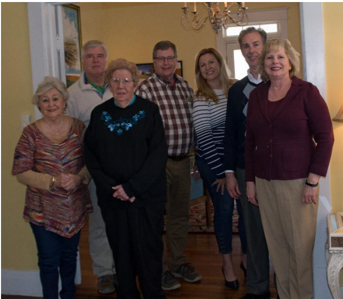
2019 Board of Directors, Preservation Zebulon