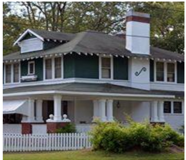
MaryBeth Carpenter 2018

“Interior architectural features include two substantial brick Craftsman fireplaces with thick, bracketed mantel shelves, four carved-wood Colonial Revival mantels, Craftsman wainscot with plate rail in the dining room, and a transverse front hall with L-shaped stair with squared balusters under a molded handrail,” it continues.