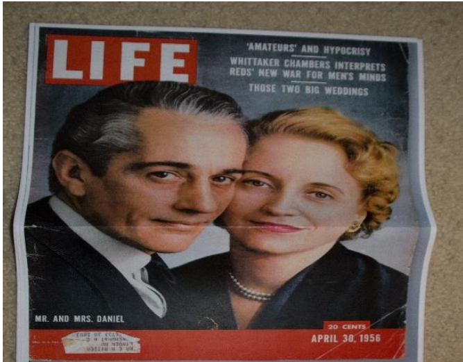
Cover of LIFE Magazine, April 1956

New York Times, eventually becoming its managing editor. He was known for his excellent writing and editing, designer suits and epicurean tastes.