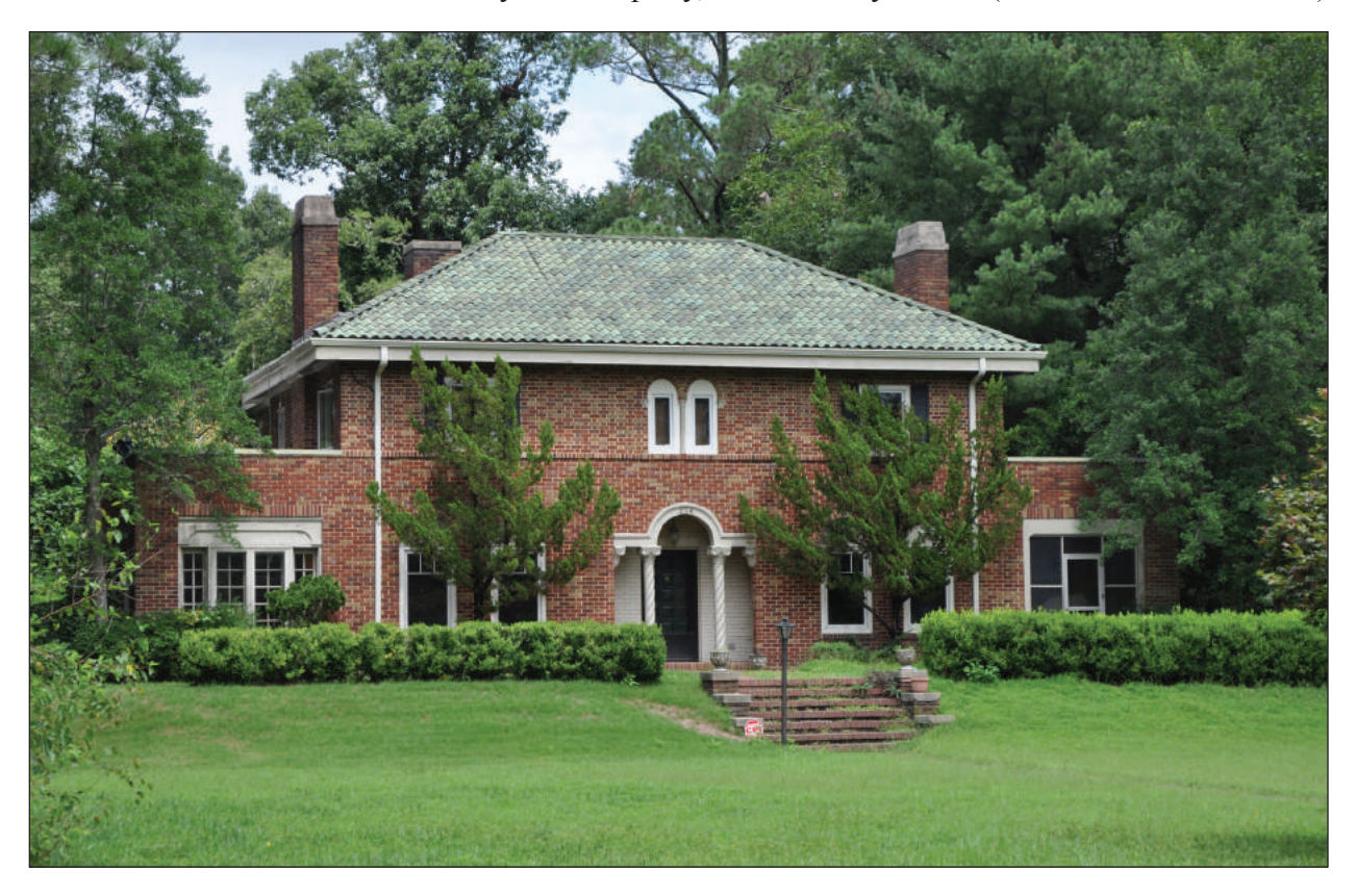
Figure 7. Potential Study List Property, C.V. Whitley House (324 W. Gannon Avenue)