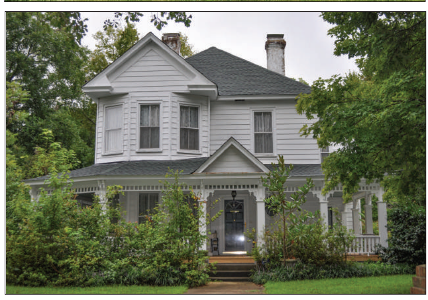
214 E. Sycamore Street