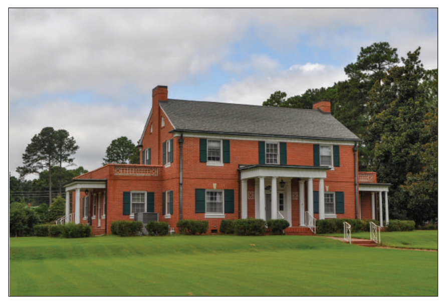
Figure 4. Examples of Property Types in the Proposed NRHP District, 2 of 2