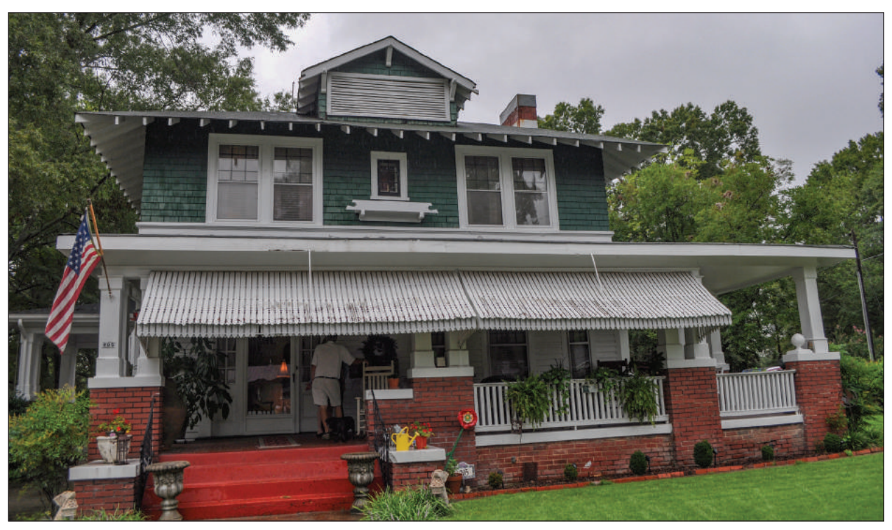
A. E.C. Daniel House (205 E. Sycamore Street)