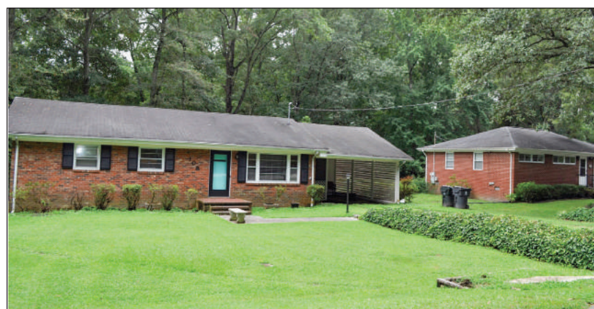
108 E. Franklin Street