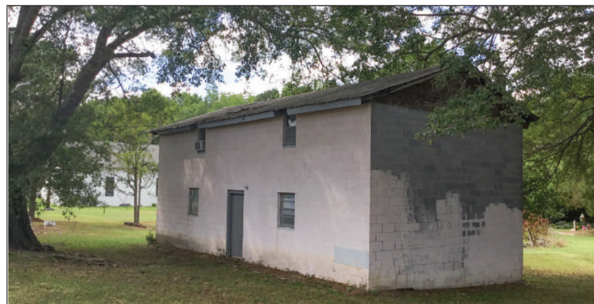
Mt. Pisgah Prince Hall Lodge No. 65