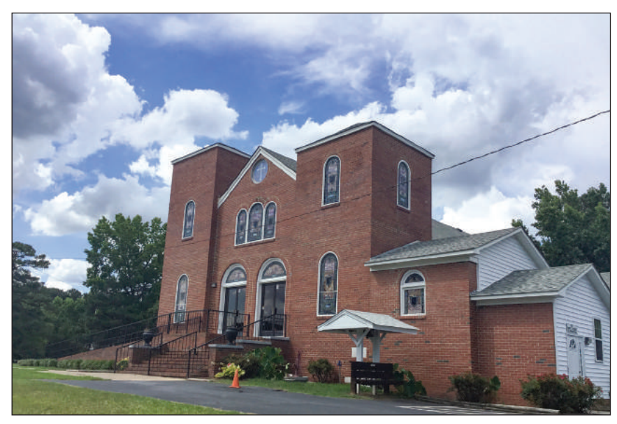
Wakefield Missionary Baptist Church and Cemetery