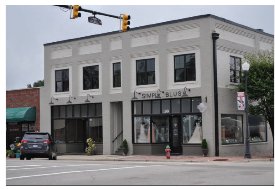
Figure 3. Examples of Property Types in the Proposed NRHP District, 1 of 2