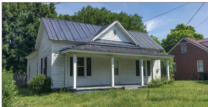
212 W. Sycamore Street