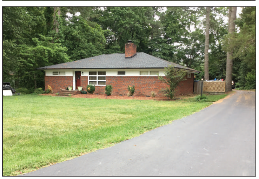
219 W. Franklin Street