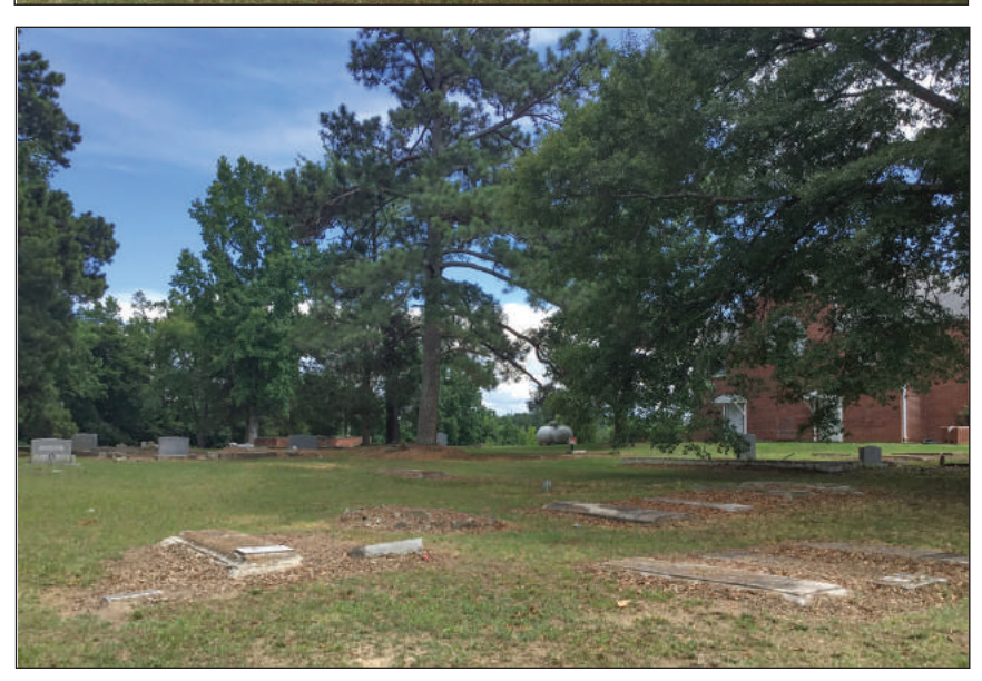
Wakefield Missionary Baptist Cemetery (809 Proctor Street)